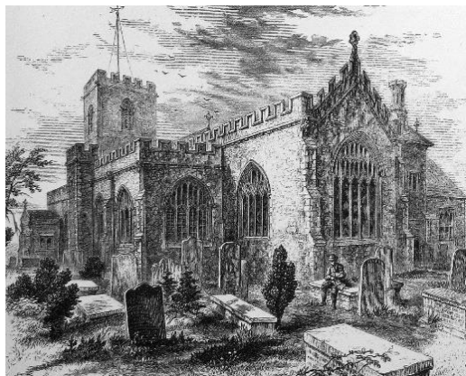
St Dunstan Stepney